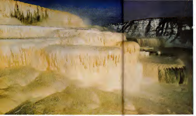
Bubbling paint pots (right) are caused by steam rung through groundwater, Manmoth Springs (above).